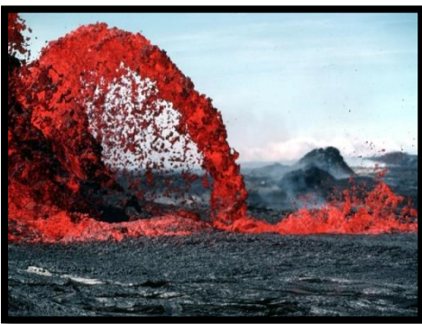
a. volcanic eruption